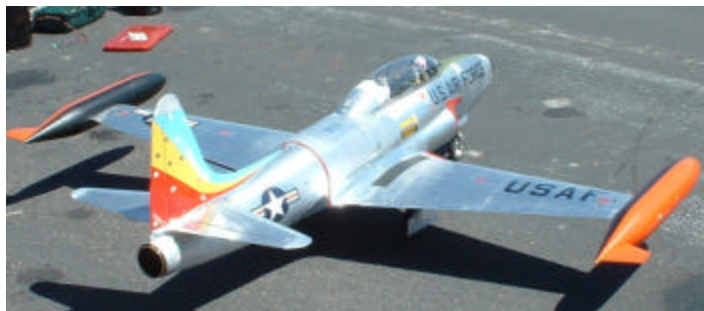
Left: Beautiful Aluminum P-80 Shooting Star Above: F-15 alongside another P-80 in the Syracuse Sun