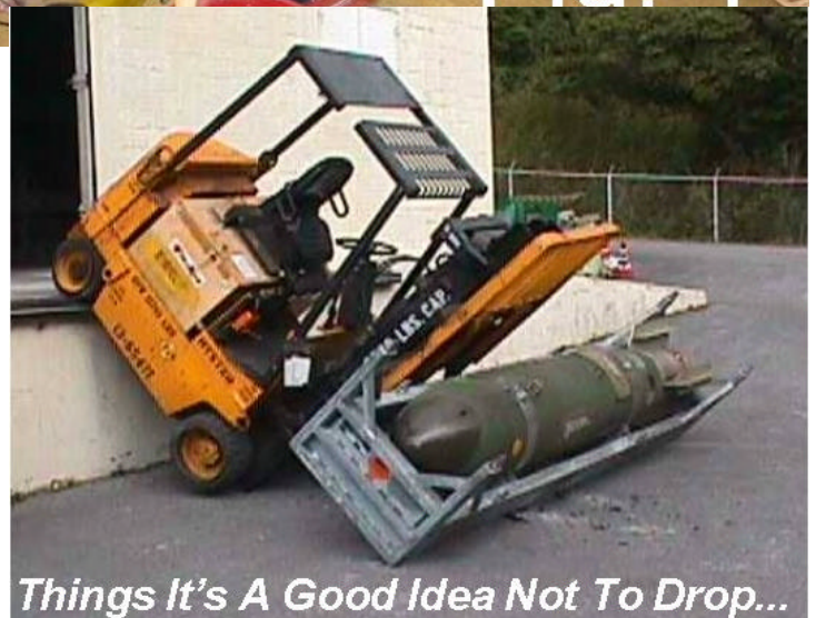
Things It's A Good Idea Not To Drop...